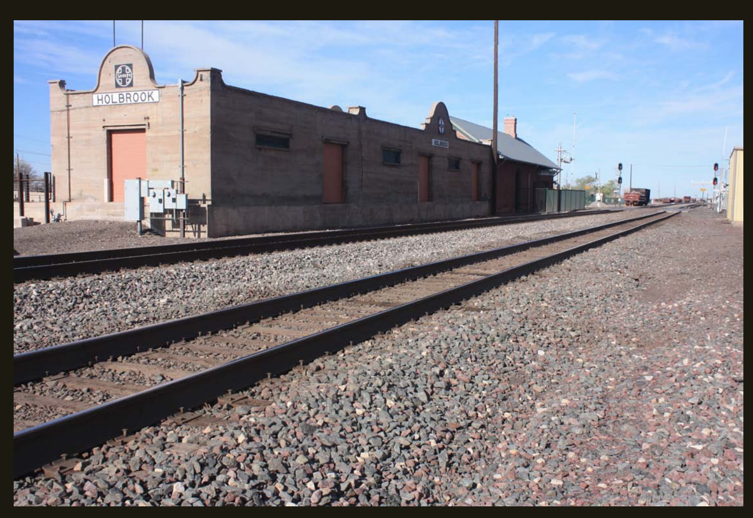
The AT&SF Holbrook Depot, bypassed by today's BNSF.