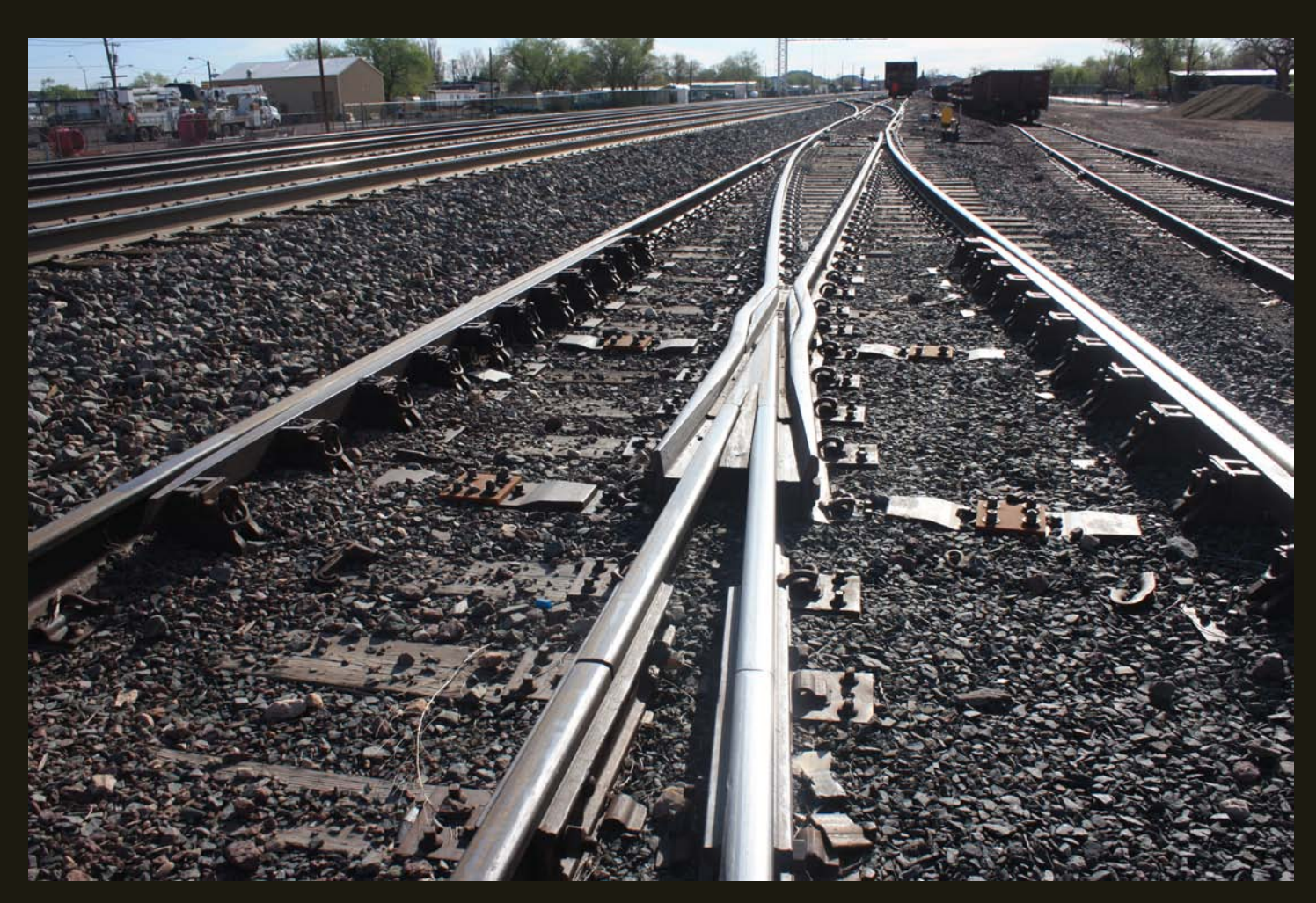
Sidings and switches of the AT&SF (now BNSF) yard at Holbrook.