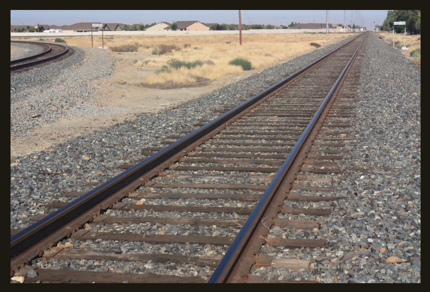
Westward view of the junction at Gosford, same location as previous. The straight track in the foreground is the MS (1893). The curved track at the far left is the east branch of the wye for the SW (1909). The curved fence line that encloses the residential area in the distance between the two tracks is just behind and parallel to the west branch of the wye, which can barely be seen in the right distance where it joins the MS (1893).