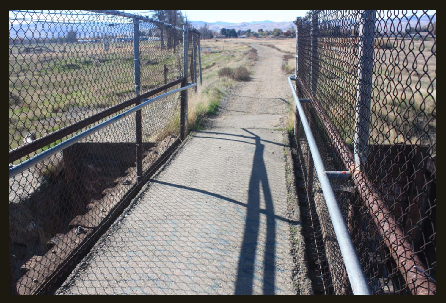
Southwestward view of the SP Coalinga Branch (1888) from the bridge over Gatos Creek, showing the grade curve from due west to southwest as it approaches Coalinga.