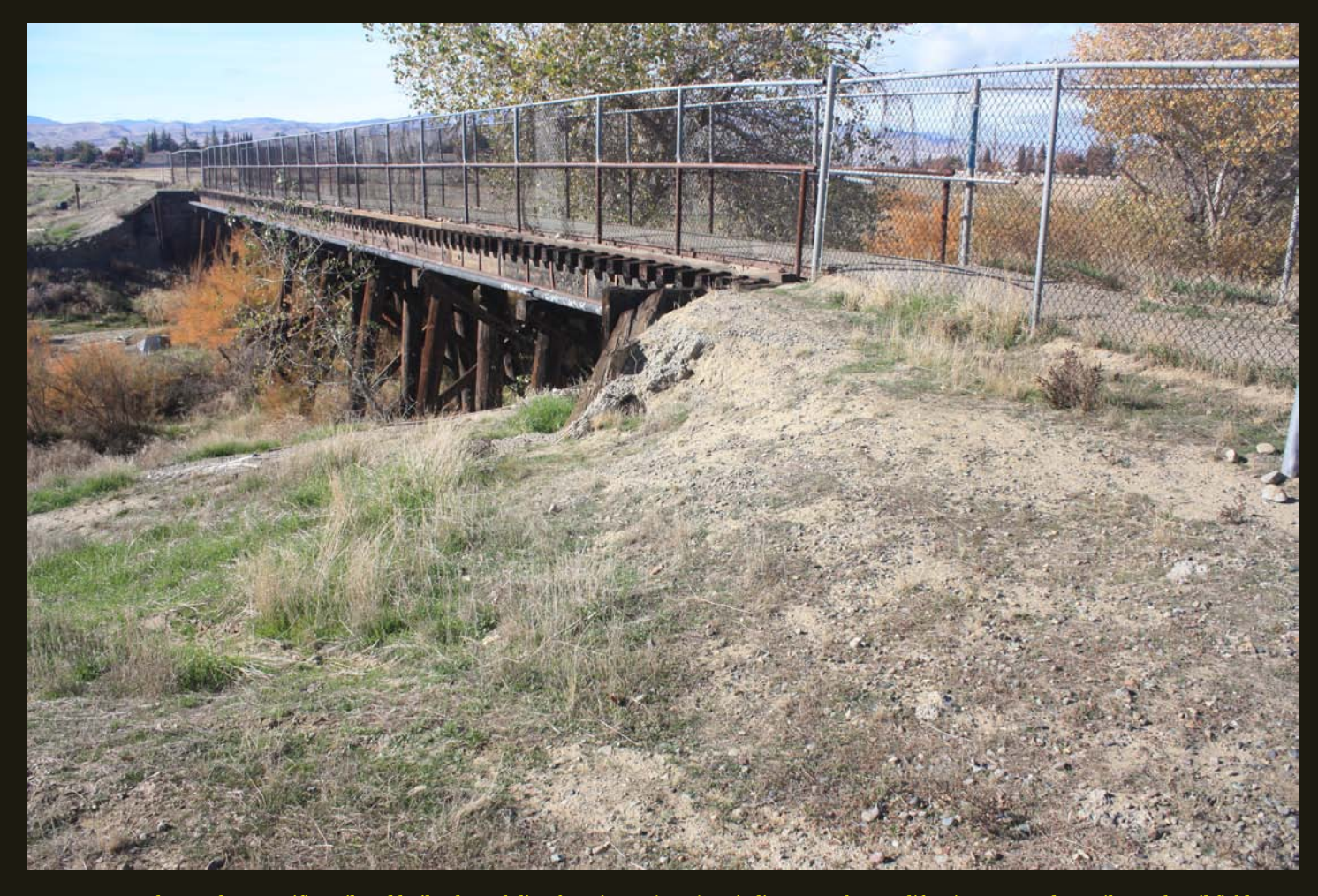
In 1887–1888, the Southern Pacific Railroad built a branch line from its SP (1876) main line at Goshen, California, westward 55 miles to the oil fields around Coalinga. The western 15 miles have been abandoned and the grade is difficult to trace, except for this beautiful bridge that crosses Gatos Creek just east of the town of Coalinga.