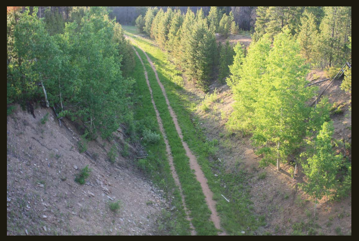
The LHP&P grade at Wyocolo, the same location as above. Note the deep cut in the foreground.