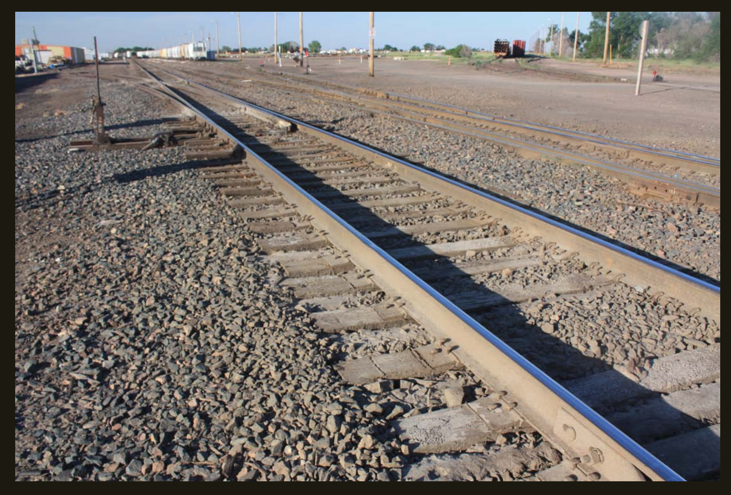
In 1880, the DP and Kansas Pacific Railroads merged with the Union Pacific system. In 1881, the Union Pacific completed construction of its Julesburg Branch, connecting the DP line at La Salle to Julesburg on the UP transcontinental main line (east of map area).

The DP mainline is the un-rusted track in the foreground, with sidings in the distance, and the curved track to the right with stored cars is the south branch of the wye for the UP Julesburg Branch at La Salle. The Julesburg Branch tracks continue for 13 miles east of La Salle and are abandoned from that point 70 miles east to a point just east of the map area, where a 10-mile-long cutoff connects the Chicago, Burlington & Quincy (now BNSF) to the remainder of the Julesburg Branch.