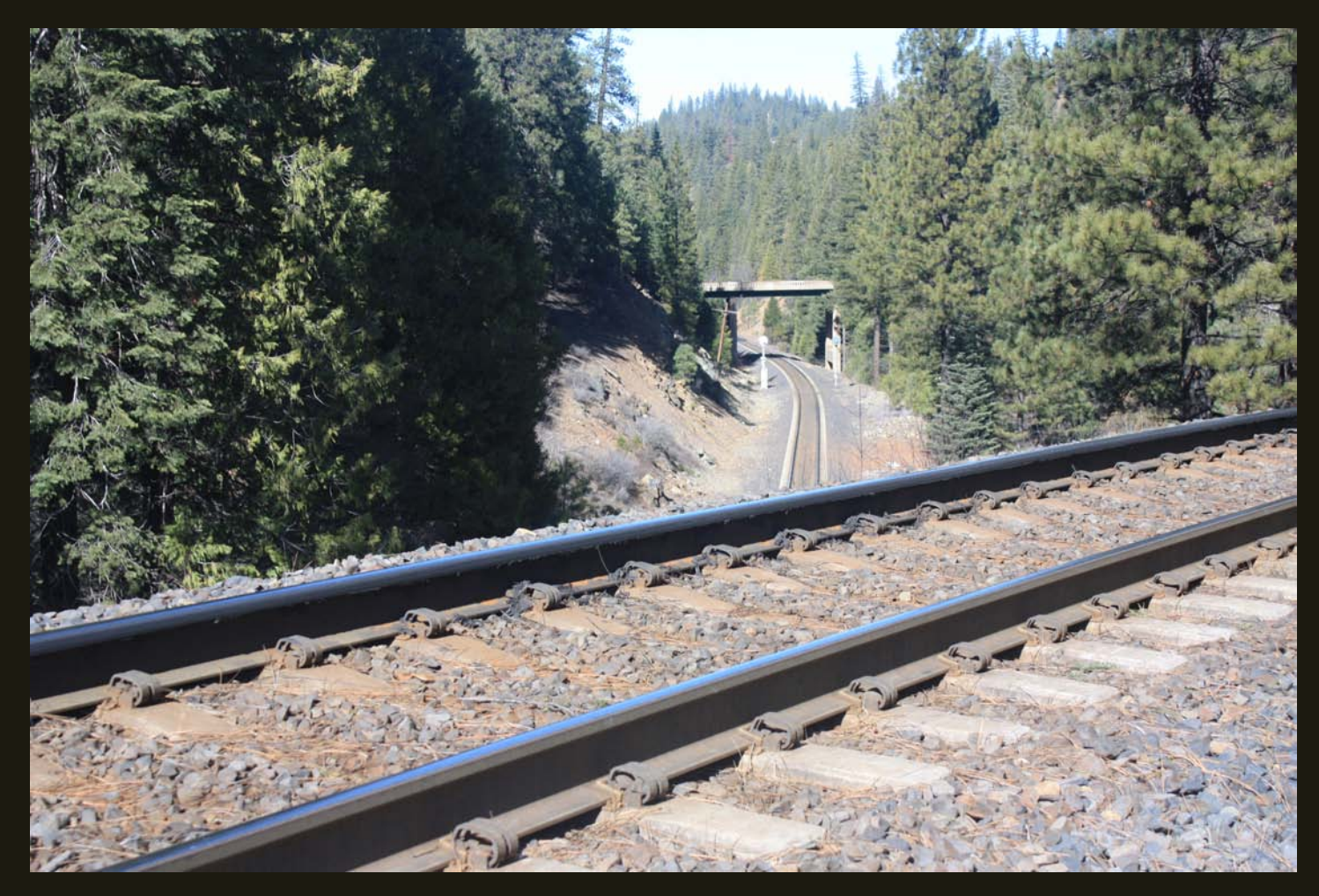
The Williams Loop maintains the railroad's overall 1.0 percent grade, the most gentle of any grade on a transcontinental railroad. The loop, together with the Spring Garden Tunnel located about a mile west of the loop, carry the grade over the west slope of the North Fork-Middle Fork divide.

This view of the upper part of the Williams Loop where it crosses over the lower part, with a road crossing in the distance. Note the Ponderosa Pines and Incense Cedars typical of the western Sierra Nevada.