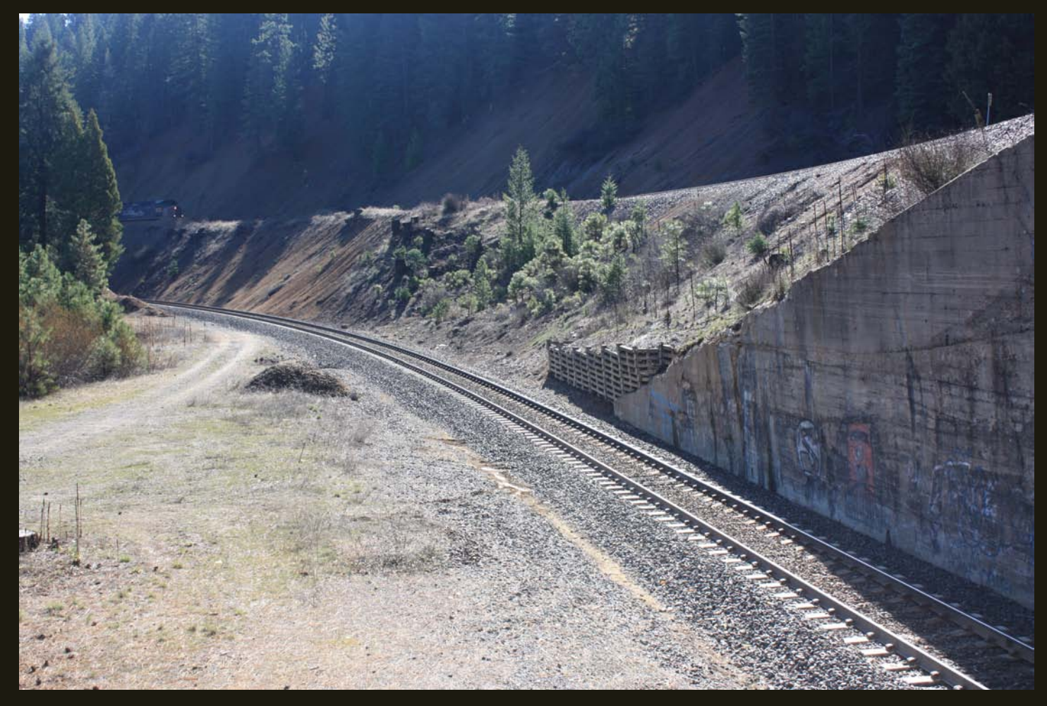
A westbound container train works down the Williams Loop after exiting the Spring Garden Tunnel.