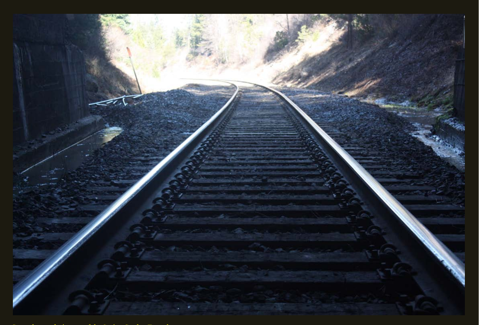
Groundwater drains out of the Spring Garden Tunnel.