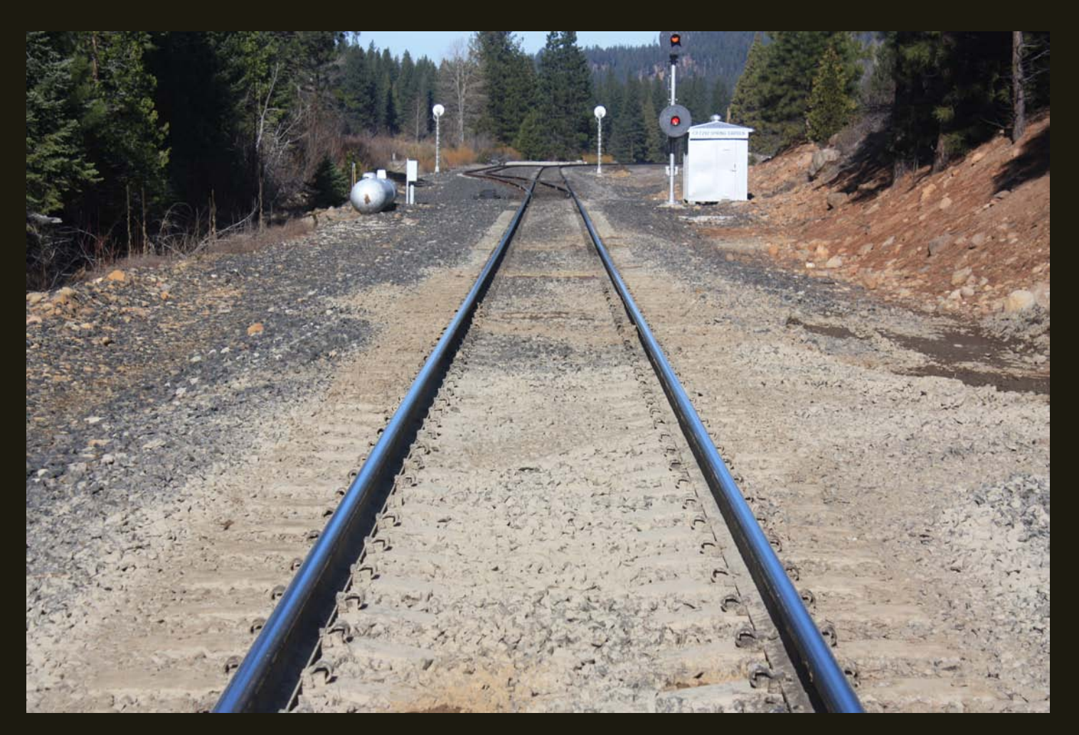
A siding just outside the west portal of the Spring Garden Tunnel.