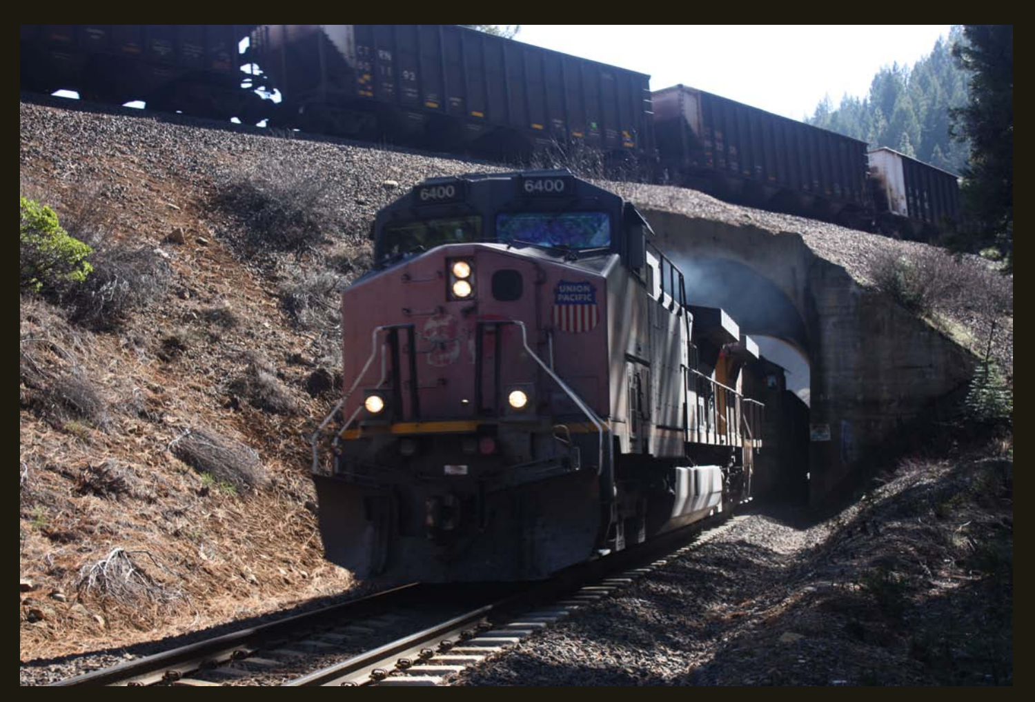
The container train passes under its own tail on the Williams Loop. The loop exists to create the elevation change in the photo.