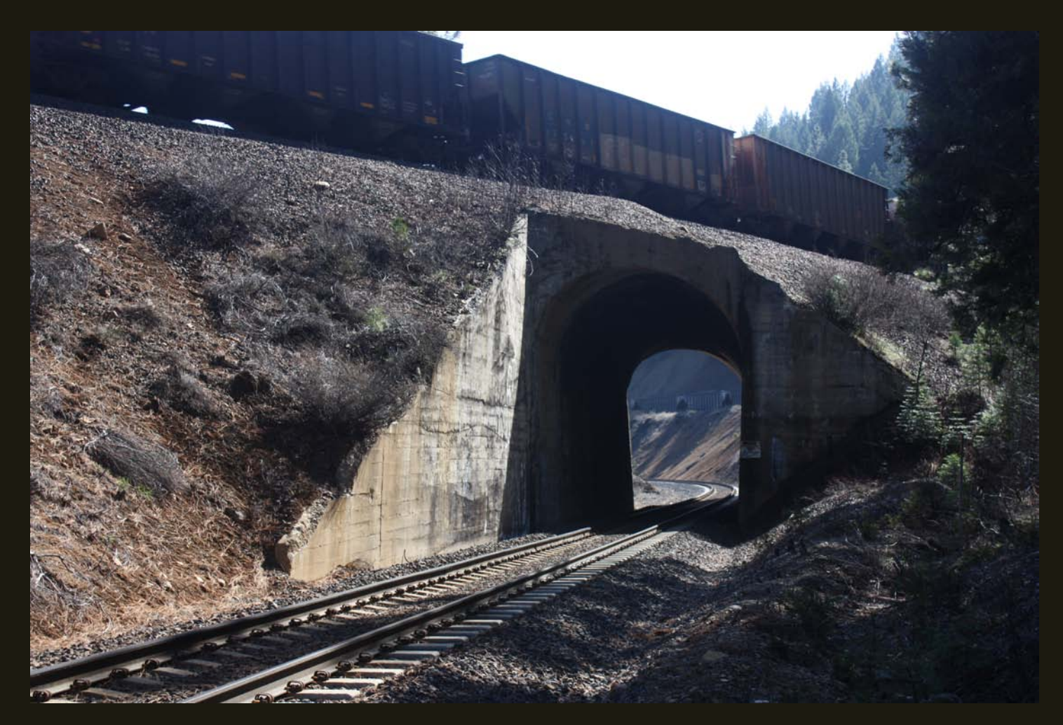
The train passes over the loop overpass.