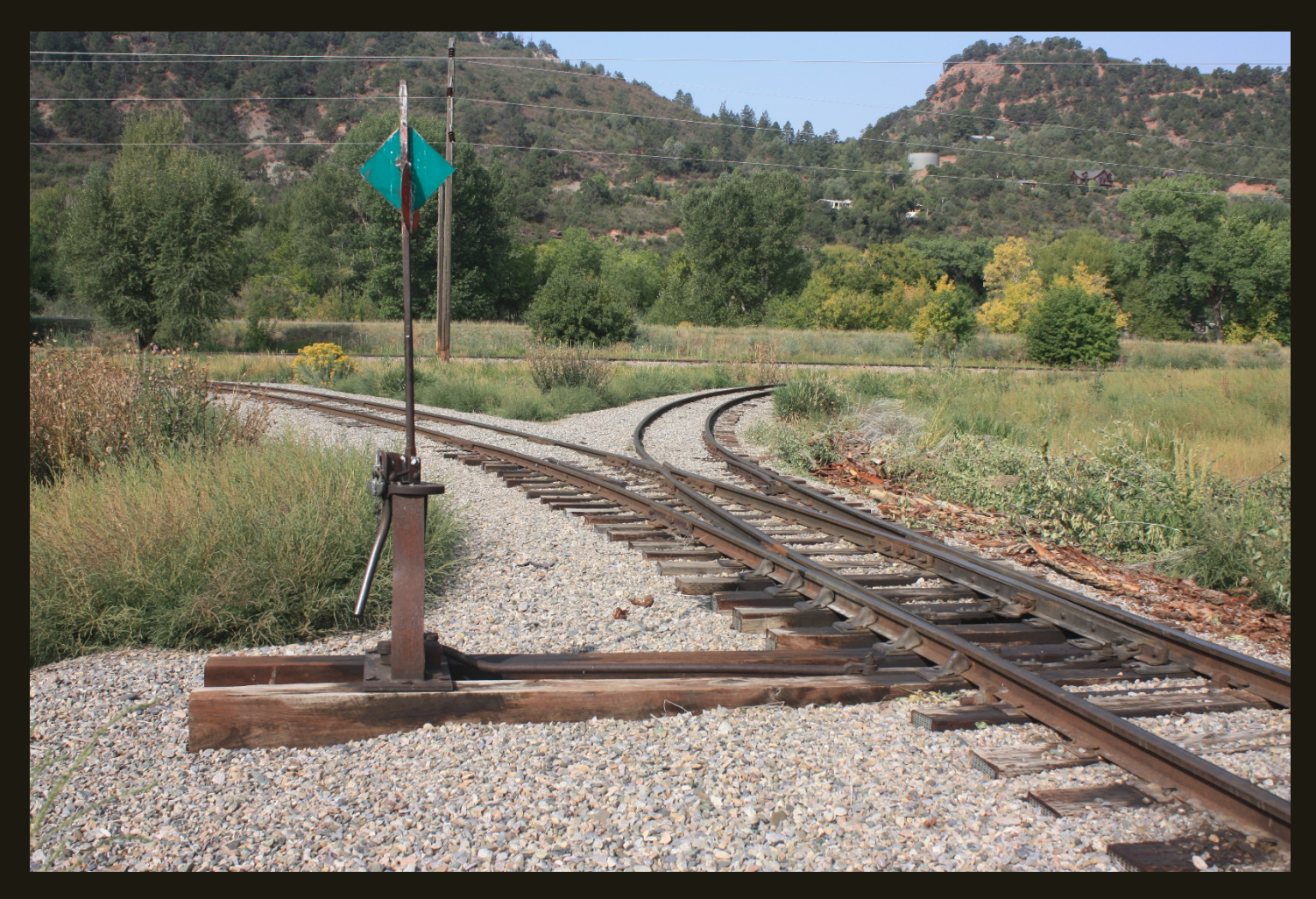
Westward view of the tip of the D&SNGRR wye. The D&RG Silverton Branch (1882n) runs across the image in the distance.