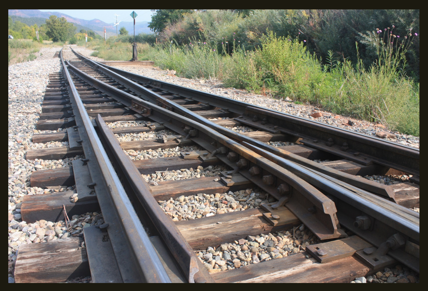
Now we are back at the D&RG Silverton Branch (1882n) looking north, toward Silverton, where the north branch of the D&SNGRR wye joins the historic narrow gauge railroad.