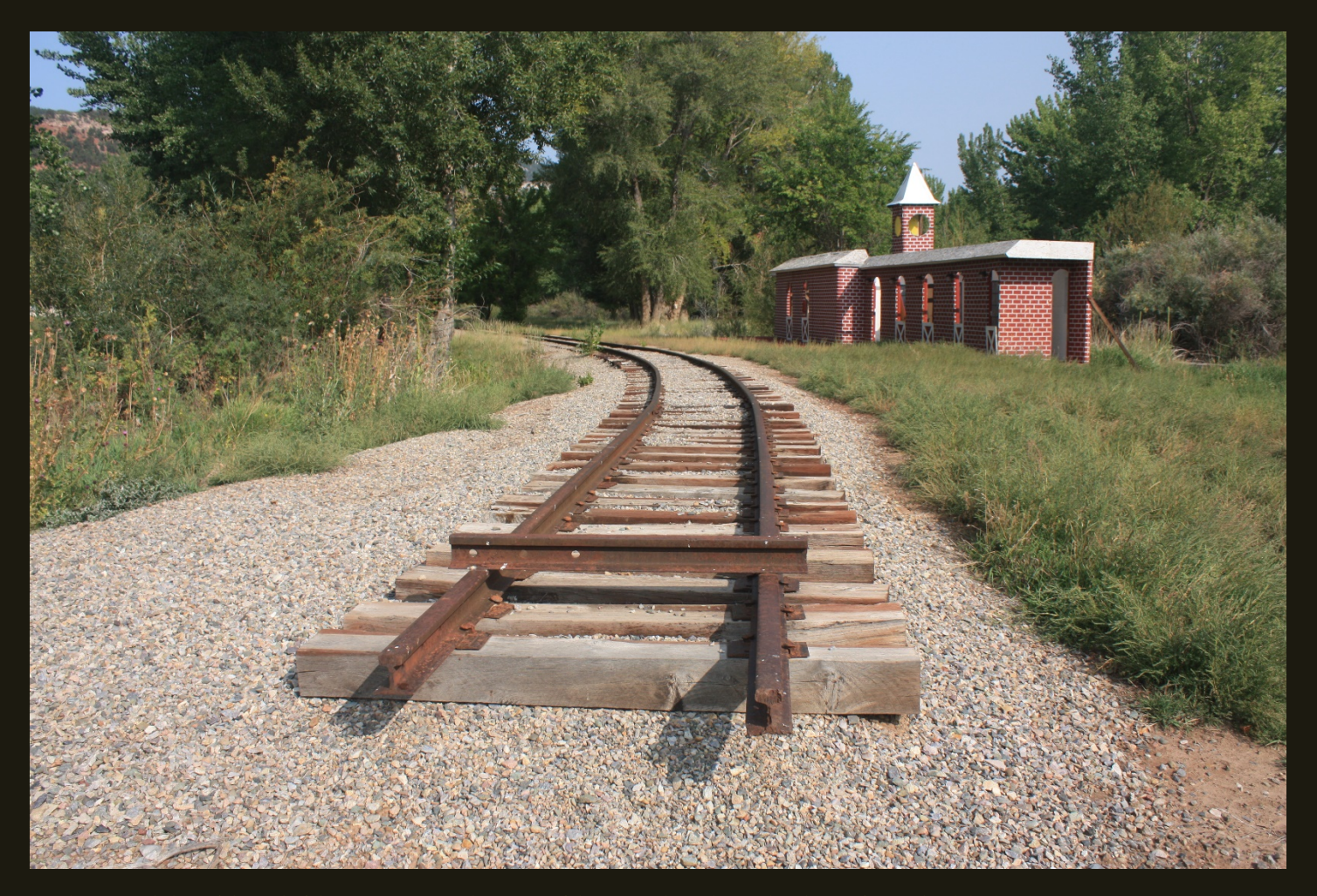
Northwestward view of the end of the D&SNGRR trackage east of the wye. The Animas River is 500 feet to the right (east).