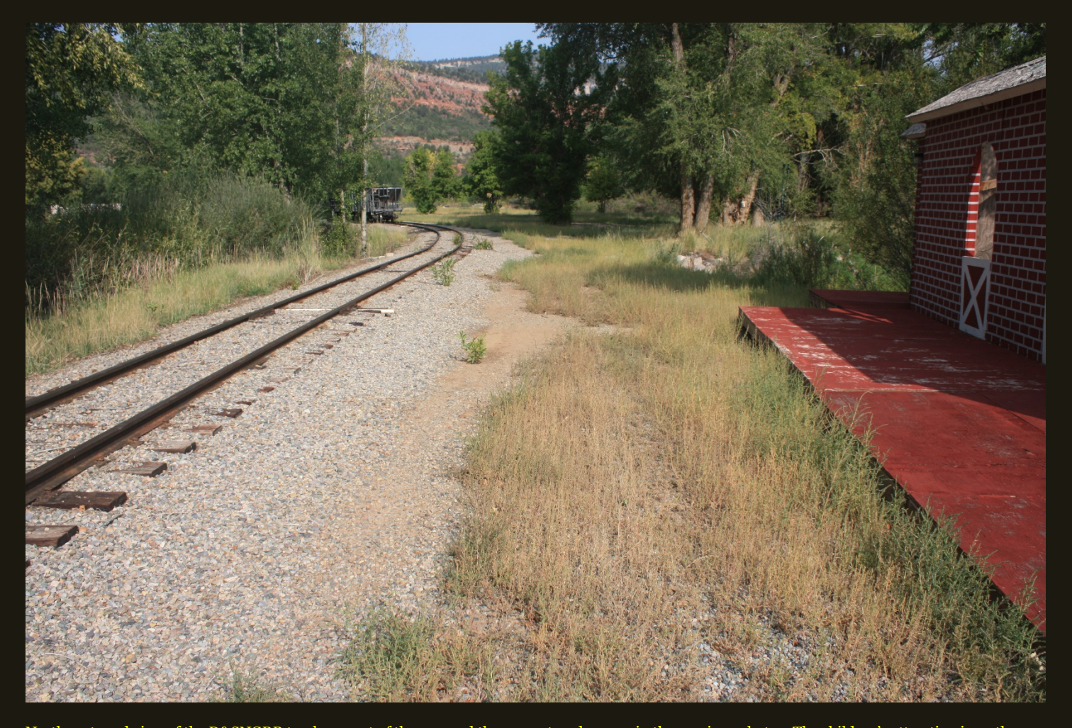
Northwestward view of the D&SNGRR trackage east of the wye and the same stored cars as in the previous photo. The children's attraction is on the right, probably for Christmas excursions.