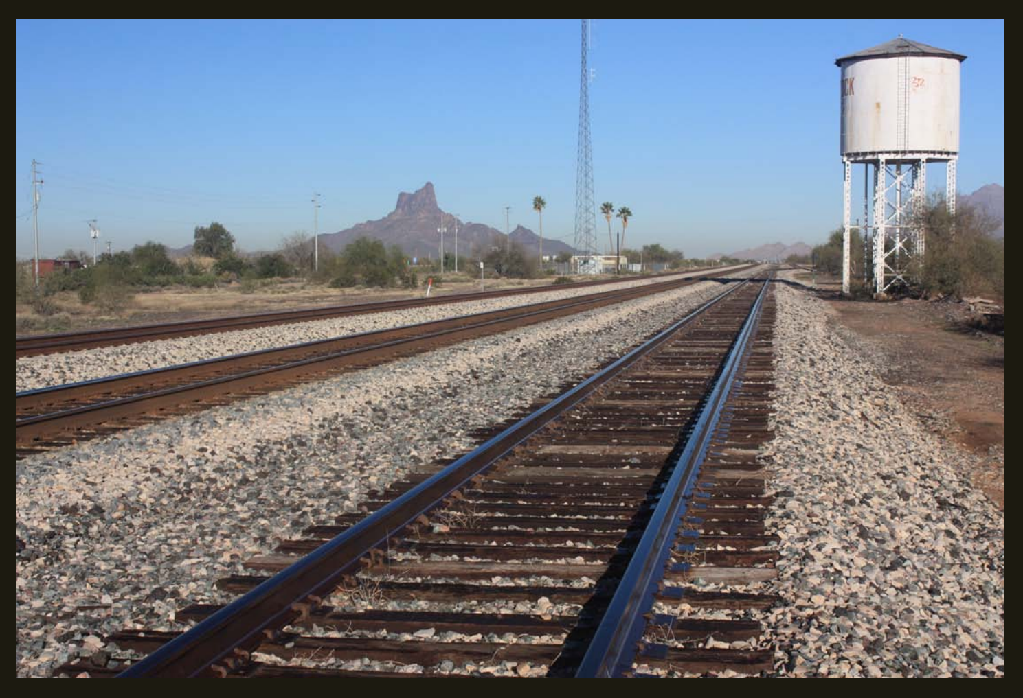
In late 1879 or early 1880, the Southern Pacific pushed its Sunset Route (1881) line eastward through this location at Red Rock, Arizona. A steel water tower was subsequently built to serve the thirsty steam locomotives that plied the southern Arizona desert for 70 years. Picacho Peak, a southern Arizona landmark, is visible in the center distance of this northwestward view.