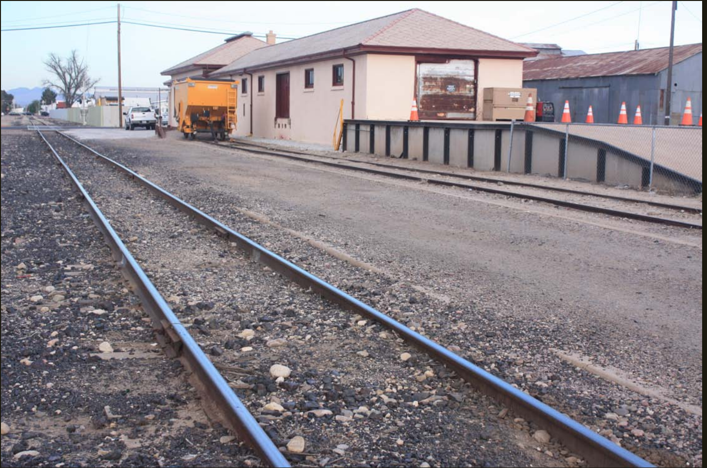
Southeastward view of the GVG&N (1898) and the Safford Depot; note loading dock and siding.