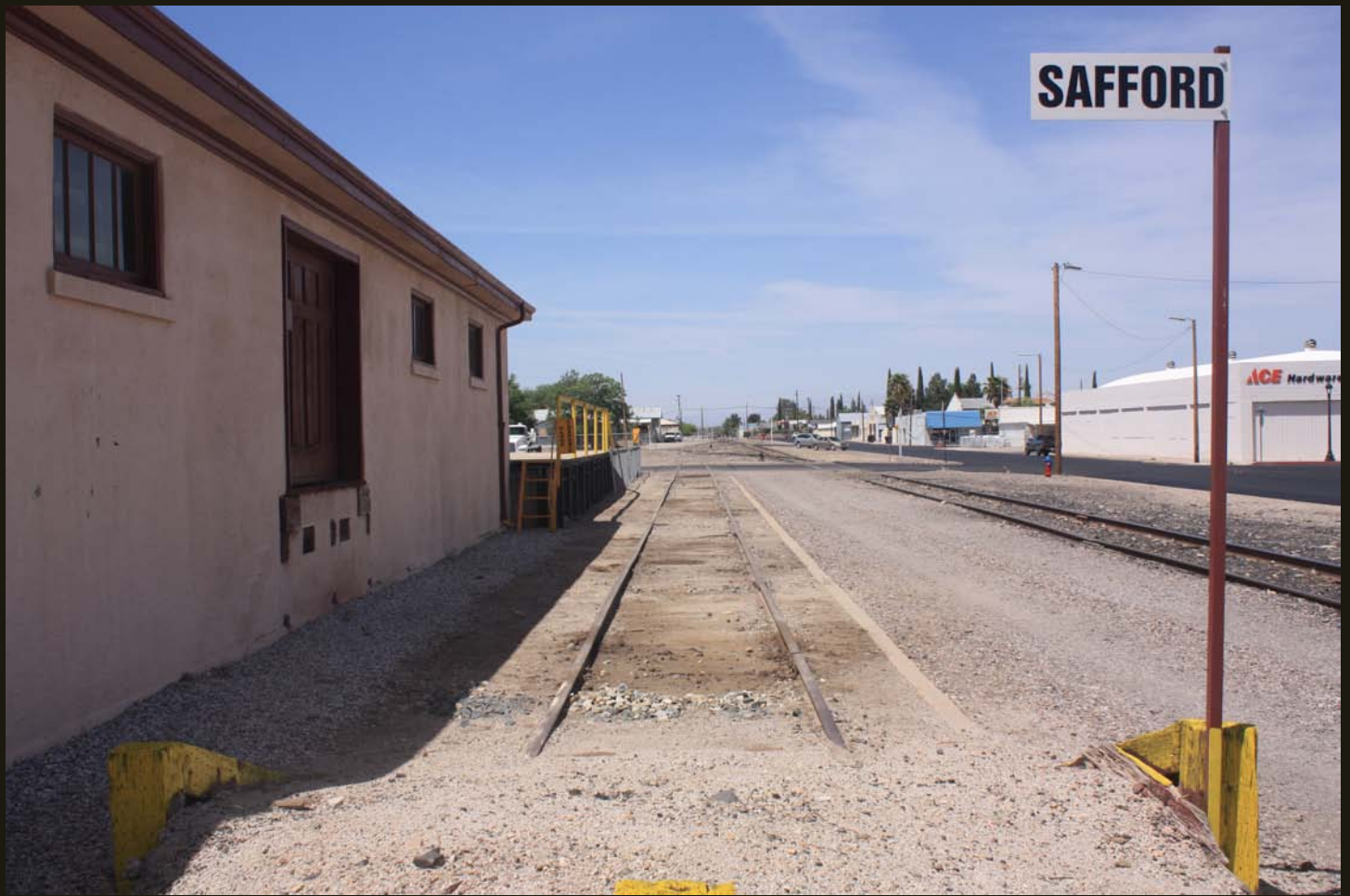
A closer northwestward view of the GVG&N (1898) and the Safford Depot. Below, an AE truck decal.