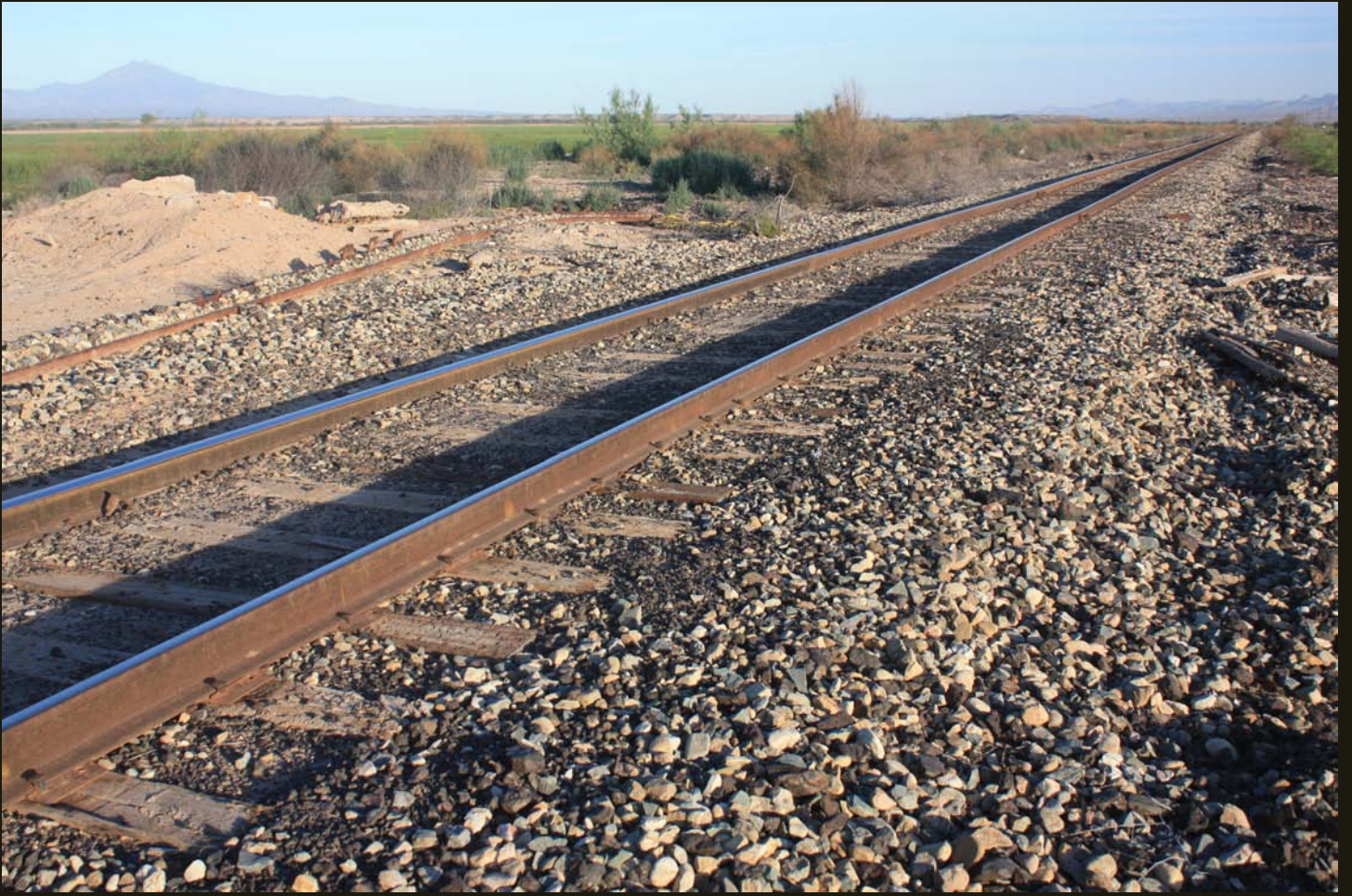
Southeastward view of the GVG&N (1898) a few miles northwest of Safford. Note the green agricultural land on the Gila River floodplain.