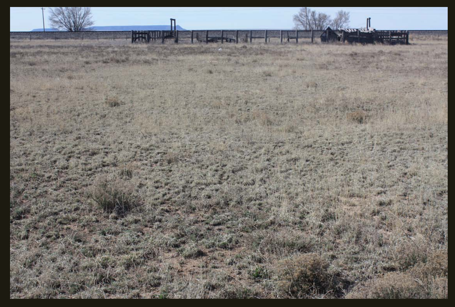
An old stock pen adjacent to the ERNM at Encino, about 20 miles east of Culebra. The train does not stop here anymore. Note the distant mesa, the last vestige of topography and a manifestation of the flat-lying sedimentary rocks that underlie the Great Plains.