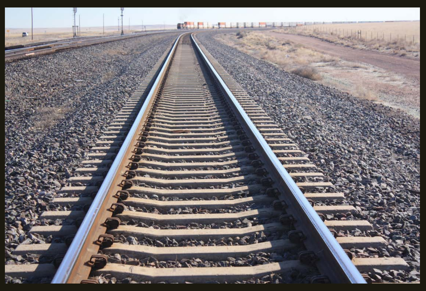
In July 1908, the Atchison, Topeka & Santa Fe Railroad-owned Eastern Railway of New Mexico completed construction of the "Belen Cutoff," allowing through freight trains to bypass the original AT&SF-A&P route via Raton Pass.

The ERNM here, at the siding of Culebra, is east of the western mountains and well onto the Great Plains. Note that one of the tracks has concrete ties and the other still has wooden ties, as does the siding where a westbound container train waits.