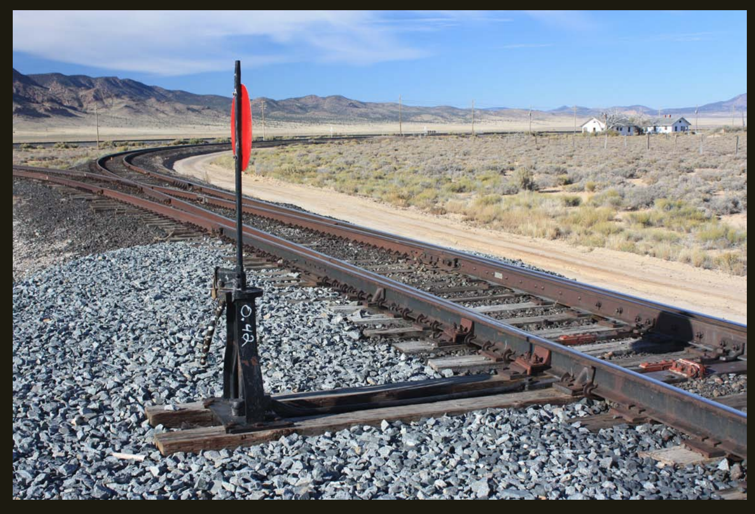
The UP-controlled Los Angeles & Salt Lake Railroad (originally San Pedro, Los Angeles & Salt Lake Railroad) completed its Cedar City Branch in 1923. The Cedar City Branch started on the LA&SL mainline at Lund, Utah; this portion of the mainline, from Milford, at the end of the 1880 Utah Southern Extension, southwest to the Nevada state line, was built in 1899 by the Oregon Short Line and in 1905 absorbed into the SPLA&SL.

This northwest view shows the SPLA&SL/LA&SL mainline in the distance behind the house and the wye for the Cedar City Branch is in the foreground. A house is all that remains of Lund, where passengers once transferred from the "Continental Limited" between Salt Lake City and Los Angeles to catch the train to Cedar City; from Cedar City they could visit the Brian Head Sky area, Cedar Breaks National Monument, Zion National Park, and other destinations. The grade is easy through the flat Escalante Desert, one of many enclosed basins within the Great Basin. The Wah Wah Mountains are in the distance.