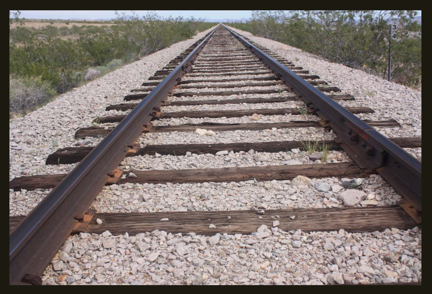
Eastward view of the LA&SL Boulder City Branch (1931), 3 miles west of the end-of-track at Boulder City.