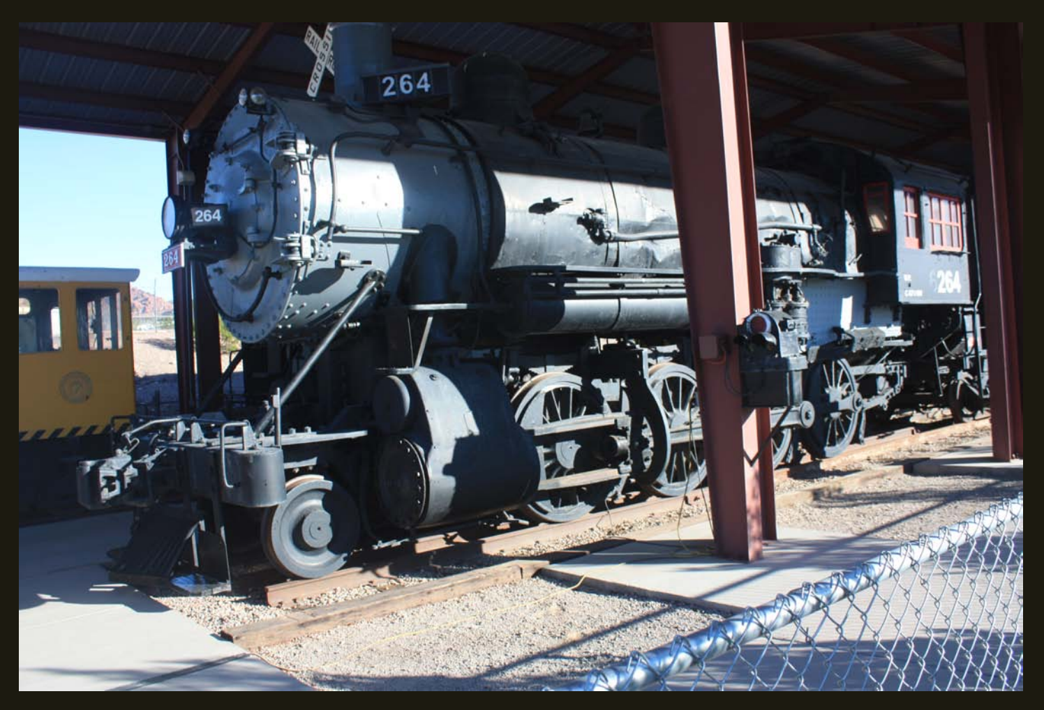
More steam on display at the Nevada State Railroad Museum in Boulder City. Knowledge of the railroads history adds to the astounding construction history associated with Hoover Dam.