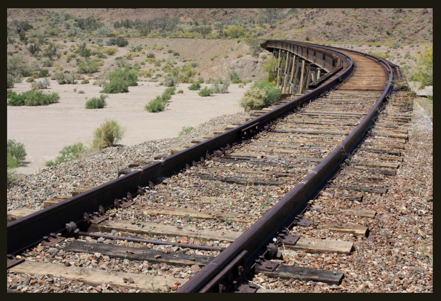
The Eagle Mountain Railroad was constructed in 1947–1948 by the Kaiser Steel Corporation to haul iron ore 51 miles from Kaiser's Eagle Mountain Mine to an interchange with the Southern Pacific mainline at "Ferrum" (Latin for "iron"). The railroad was last used in 1986 and remains dormant. The EMRR features grades as steep as 2.15 percent on its climb out of the Salton Trough.

On its climb up Salt Creek Wash, the EMRR crosses the wash on this steel bridge.