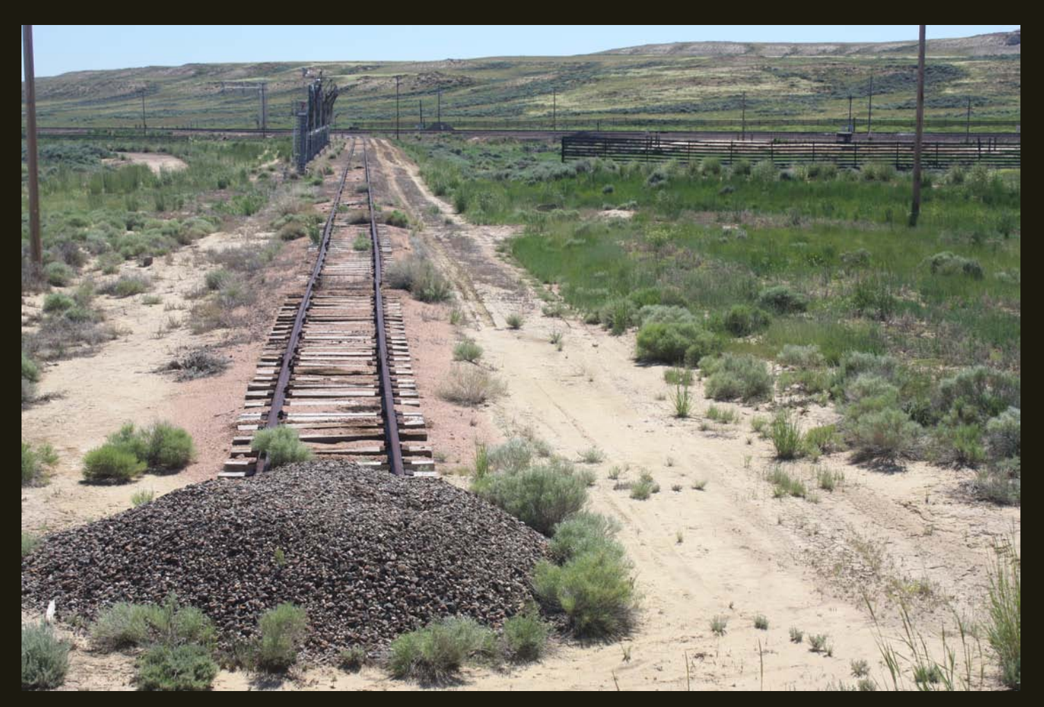
A spur off the UP mainline at the western crossing of the Great Divide.