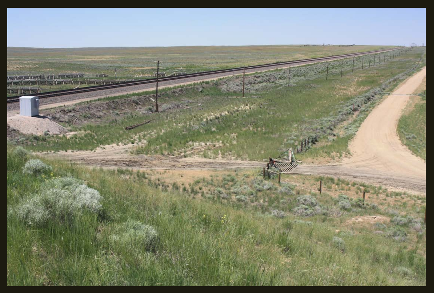
UP double track near the western crossing of the Great Divide.