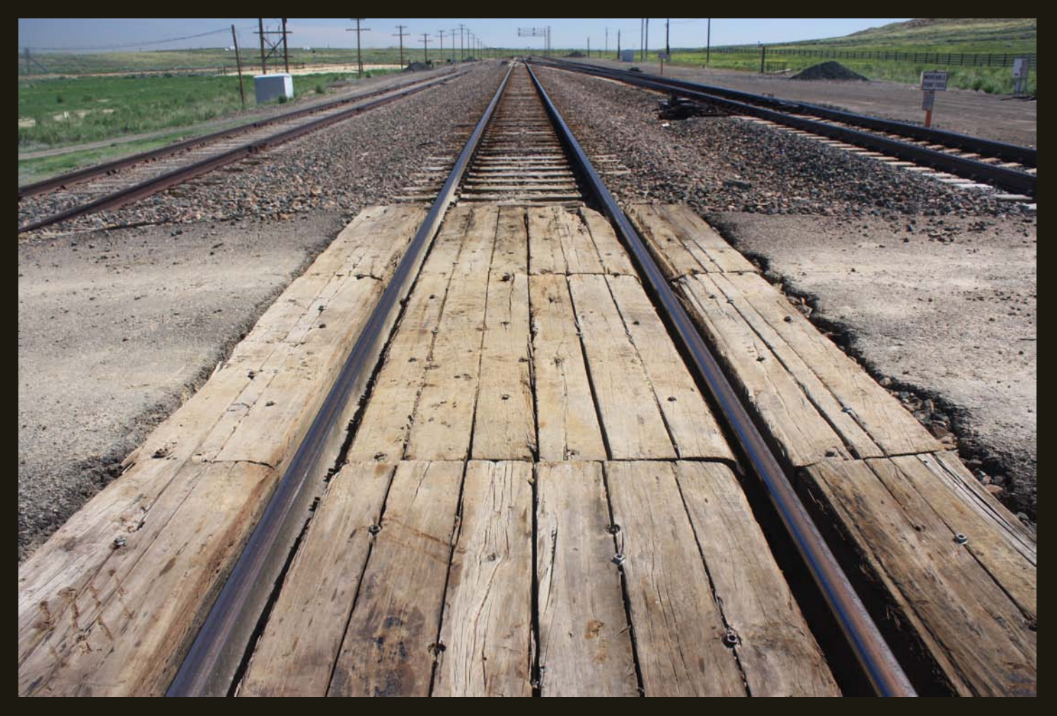
In 1868, the Union Pacific built across the Great Divide Basin, a 90 by 40 mile wide basin that splits the Great Divide into two ridges. The UP crossing of the western ridge of the Great Divide near Tipton, Wyoming, is double track with a siding (the older track on the left).