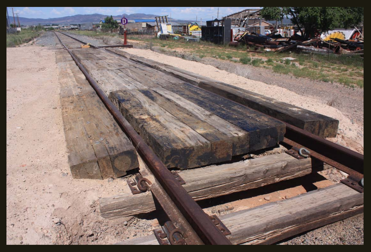
The Union Pacific-controlled Los Angeles & Salt Lake Railroad (originally San Pedro, Los Angeles & Salt Lake Railroad) completed its Cedar City Branch in 1923 to serve the iron mines in the district west of Cedar City. The Cedar City Branch started on the LA&SL mainline at Lund, Utah, and ran the first passenger train from Lund to Cedar City on July 1, 1923.

This northwest view of the Cedar City Branch in Cedar City shows the track deteriorating and undermined by erosion at a road crossing. It gets worse southeast toward the end of track, as seen the following photos.