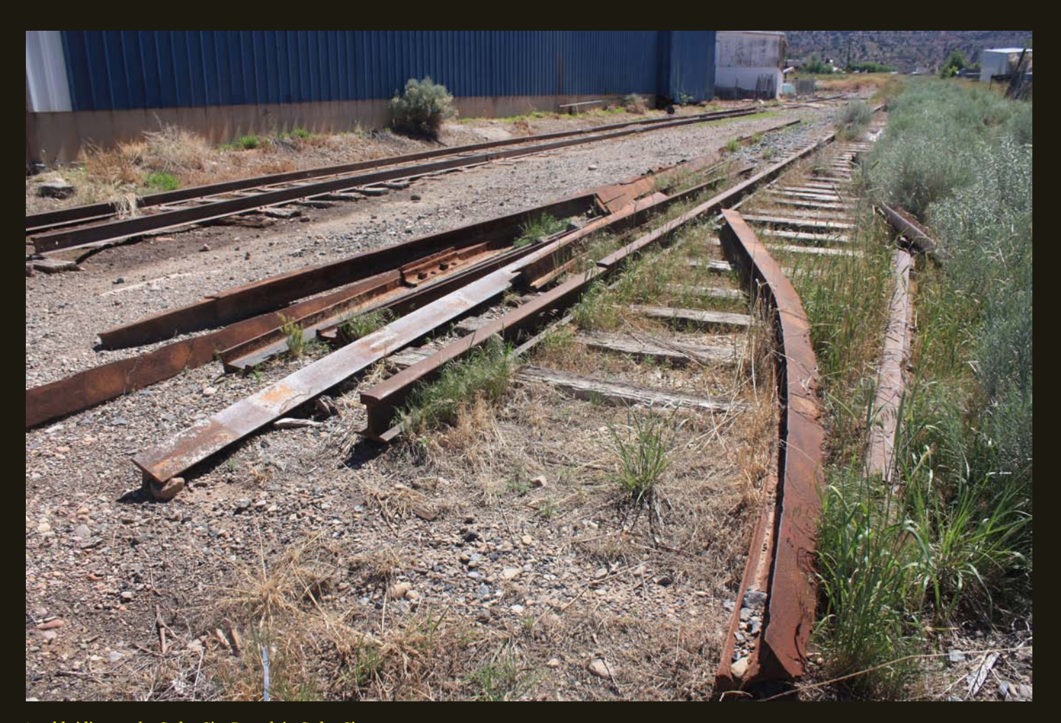
An old siding on the Cedar City Branch in Cedar City.