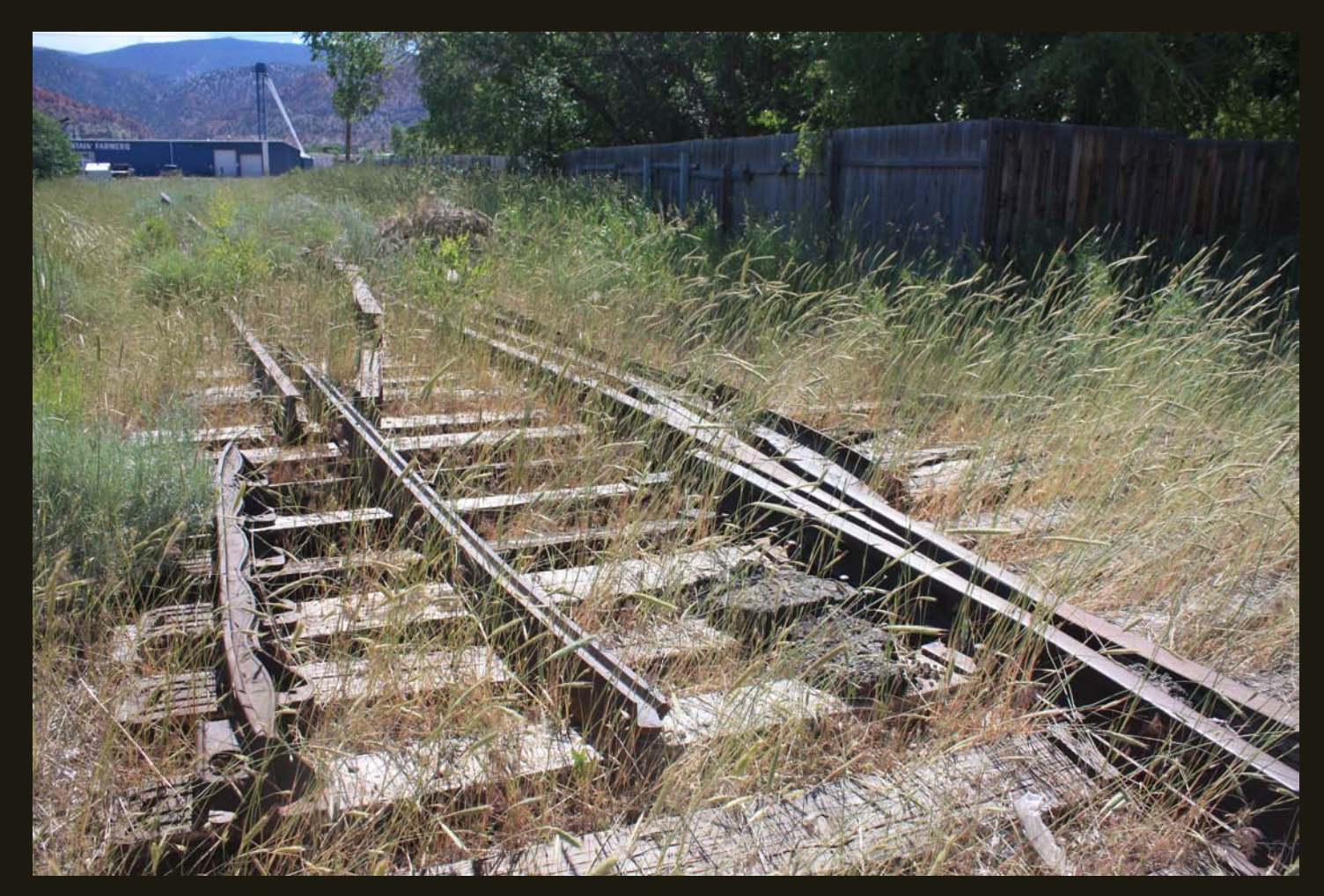
The end of track of the LA&SL Cedar City Branch in Cedar City.