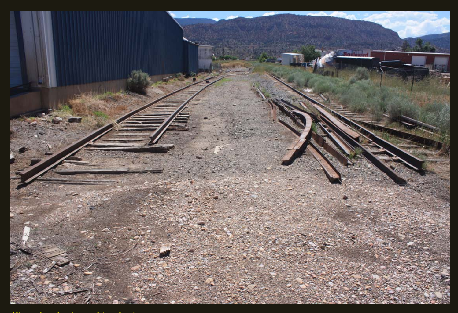
Siding on the Cedar City Branch in Cedar City.