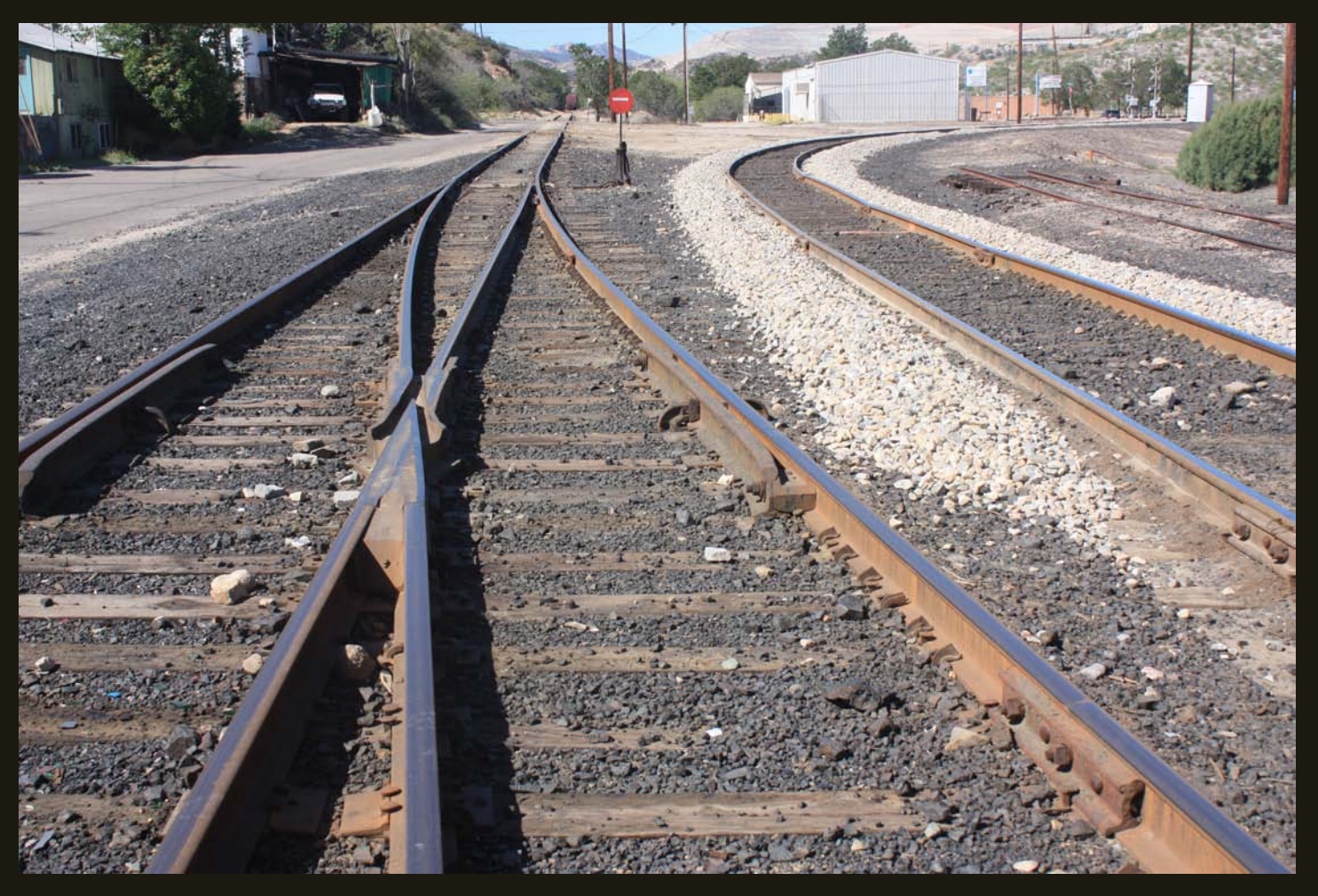
The AE Miami Extension mainline continues up the valley in this westward view and the switchback for the Miami ore processing facilities veers to the right.