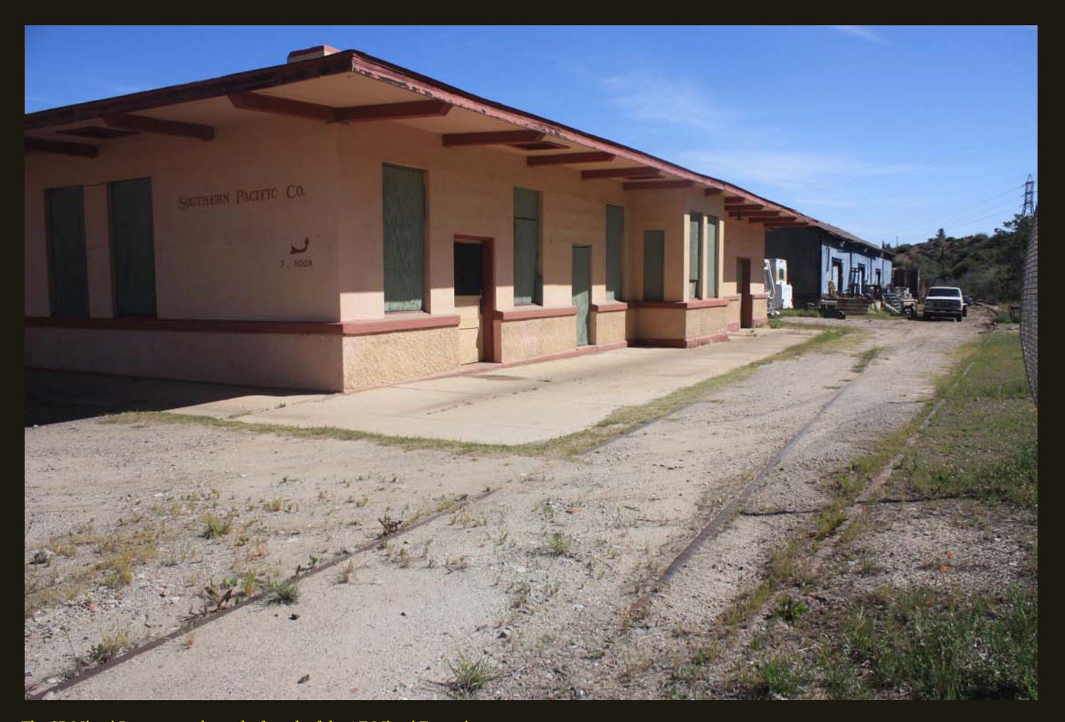
The SP Miami Depot near the end-of-track of the AE Miami Extension.