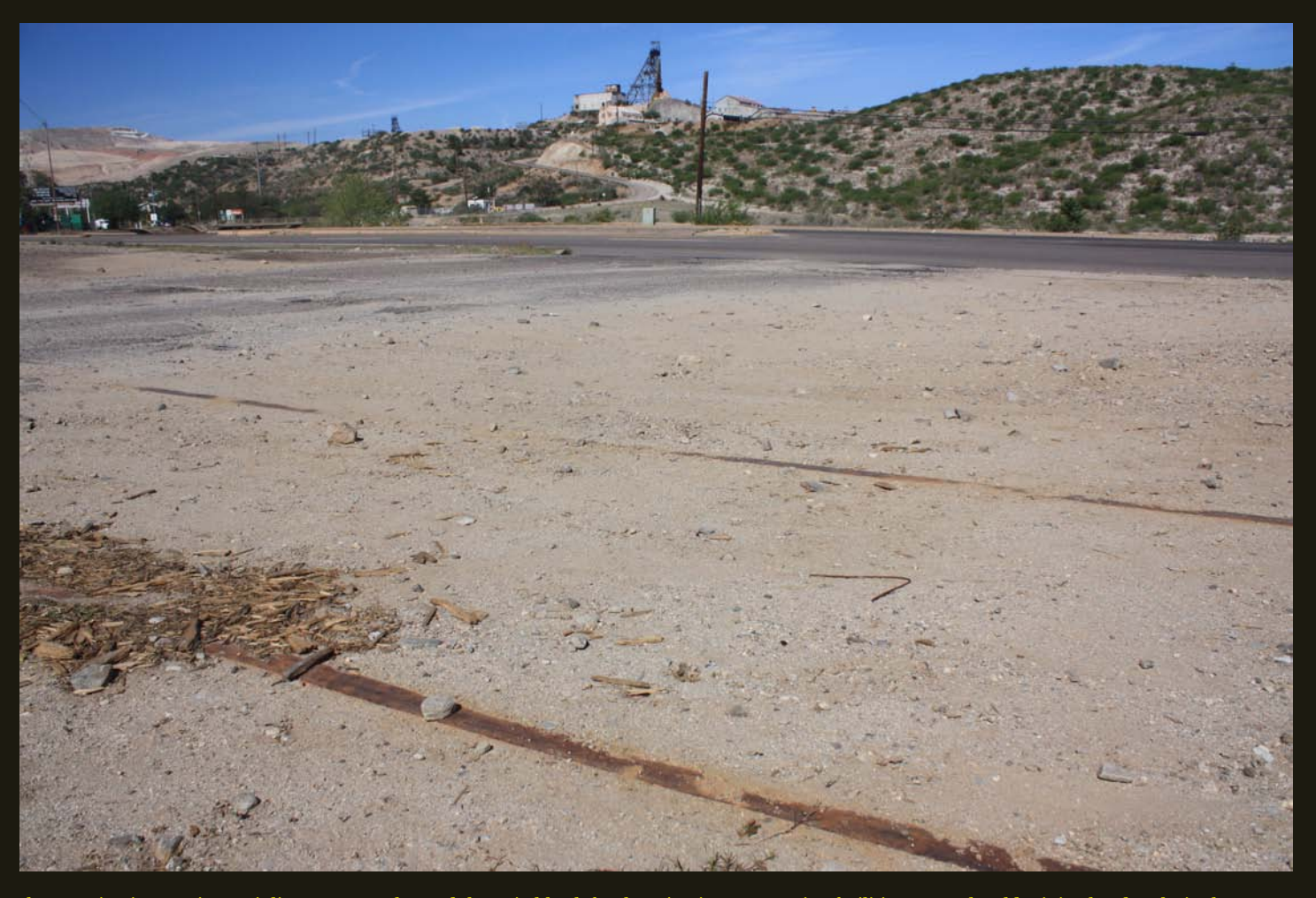
The AE Miami Extension mainline peters out beyond the switchback for the Miami ore processing facilities. Note the old mining headworks in the distance.