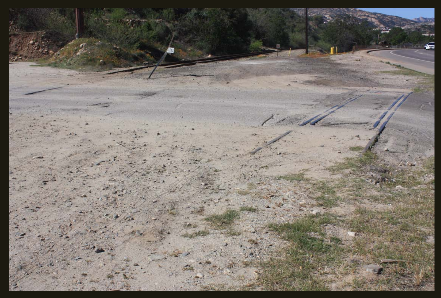
The AE Miami Extension mainline and an old, pre-highway branch near the end-of-track.