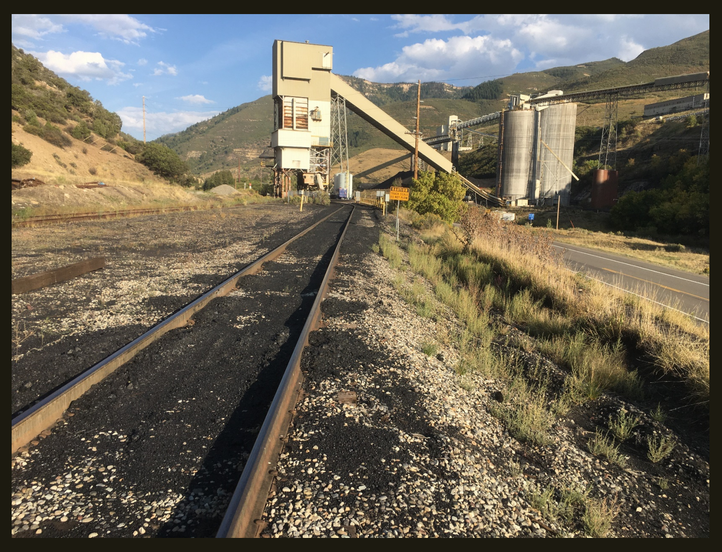
Eastward view of the D&RGW North Fork Branch (1902n) 1 mile to the east of the town of Somerset (previous location) and 1 mile shy of the end of track. The facility is for loading coal conveyed from mines higher up the mountain. Note the coal incidentally spilled along the tracks. There are no coal facilities past this point, just 1 mile of track to line up hopper cars for loading at this facility.