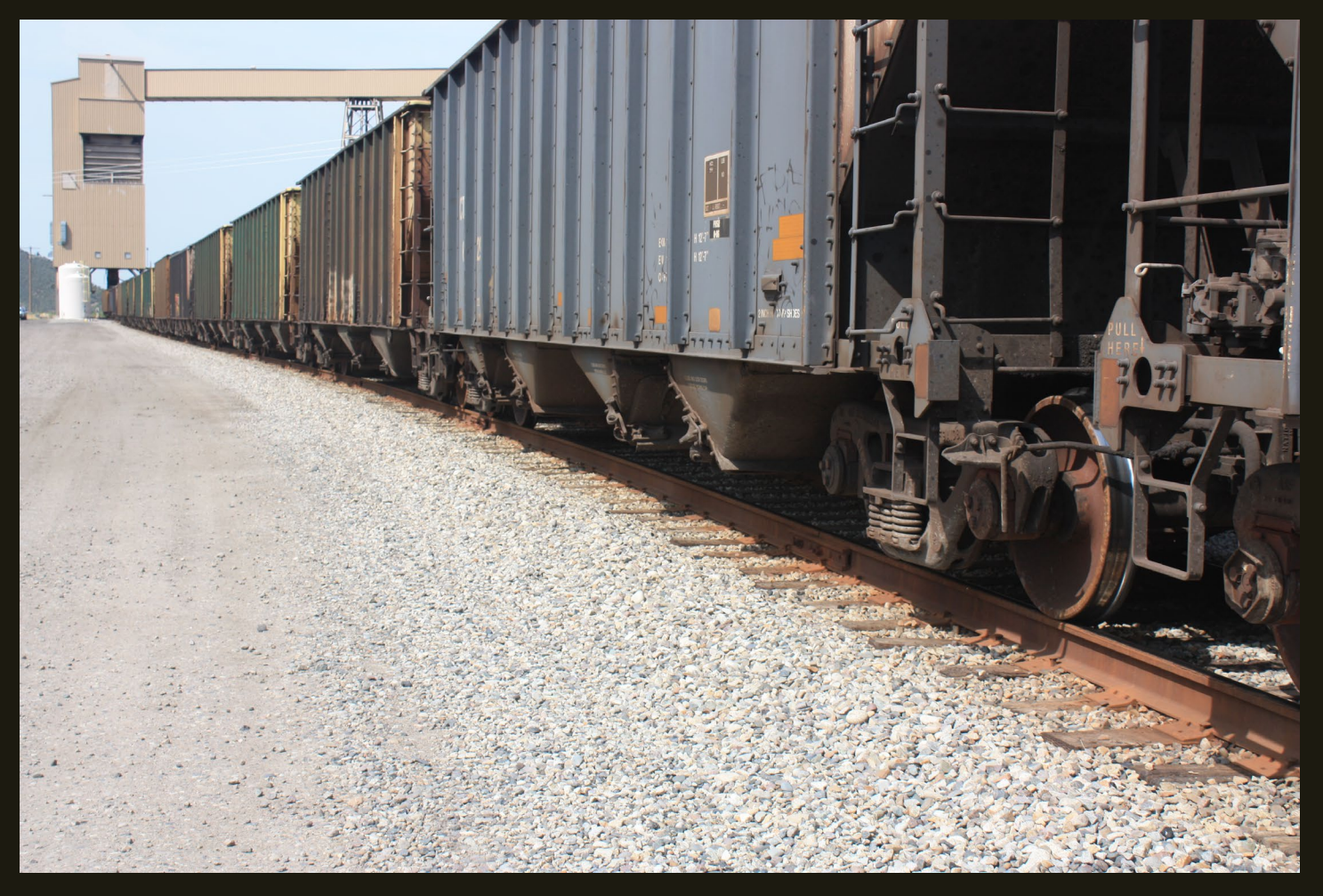
This southwestward view of the D&RGW North Fork Branch (1902n) at Bowie, located 6 miles northeast of Paonia and 7 miles shy of the end of track near Somerset, shows hopper cars lined up for coal conveyed from mines higher up the mountain.