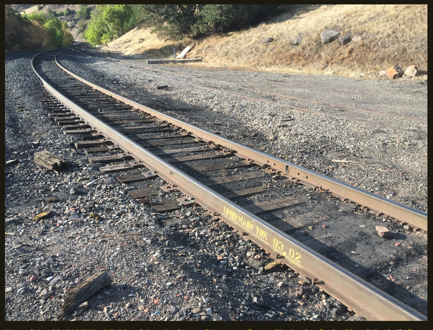
Westward view of the D&RGW North Fork Branch (1902n) at the town of Somerset, 5 miles east of Bowie and 2 miles shy of the end of track. The line splits off a siding for coal loading to the east.