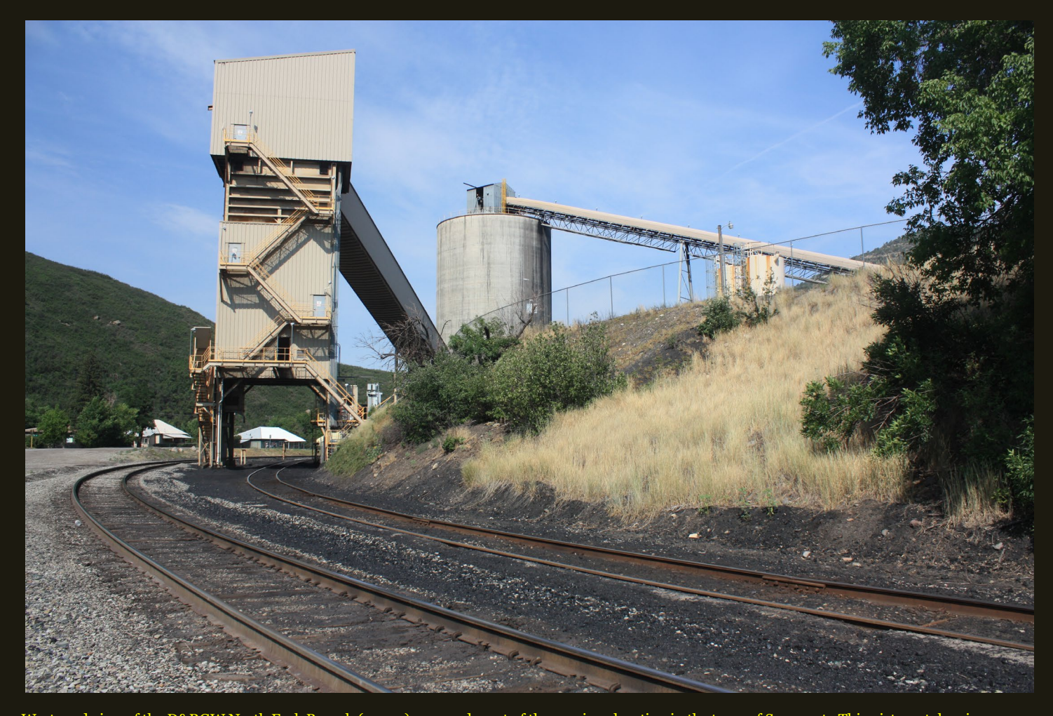
Westward view of the D&RGW North Fork Branch (1902n) 100 yards east of the previous location in the town of Somerset. This picture, taken in 2011, shows the original coal loading facility in Somerset; this facility was completely gone in 2021. This is the location of the end of the 1902 narrow gauge line; the standard gauge line was extended another two miles east in 1929.