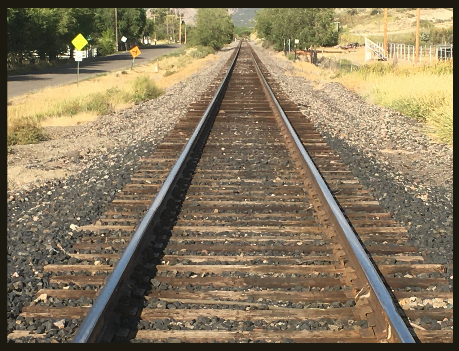
Northeastward view of the D&RGW North Fork Branch (1902n) at the same location as previous.