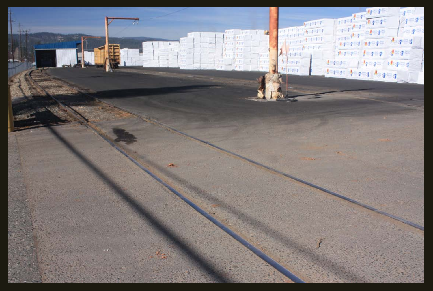
The end of the Quincy Railroad at the Sierra Pacific Industries mill in Quincy, which ships over 1,000 railcars per year of outbound lumber and forest products.