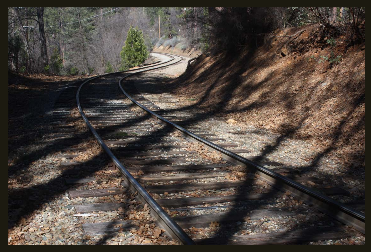
The Quincy Railroad winds down the hill from Quincy Junction to Quincy.