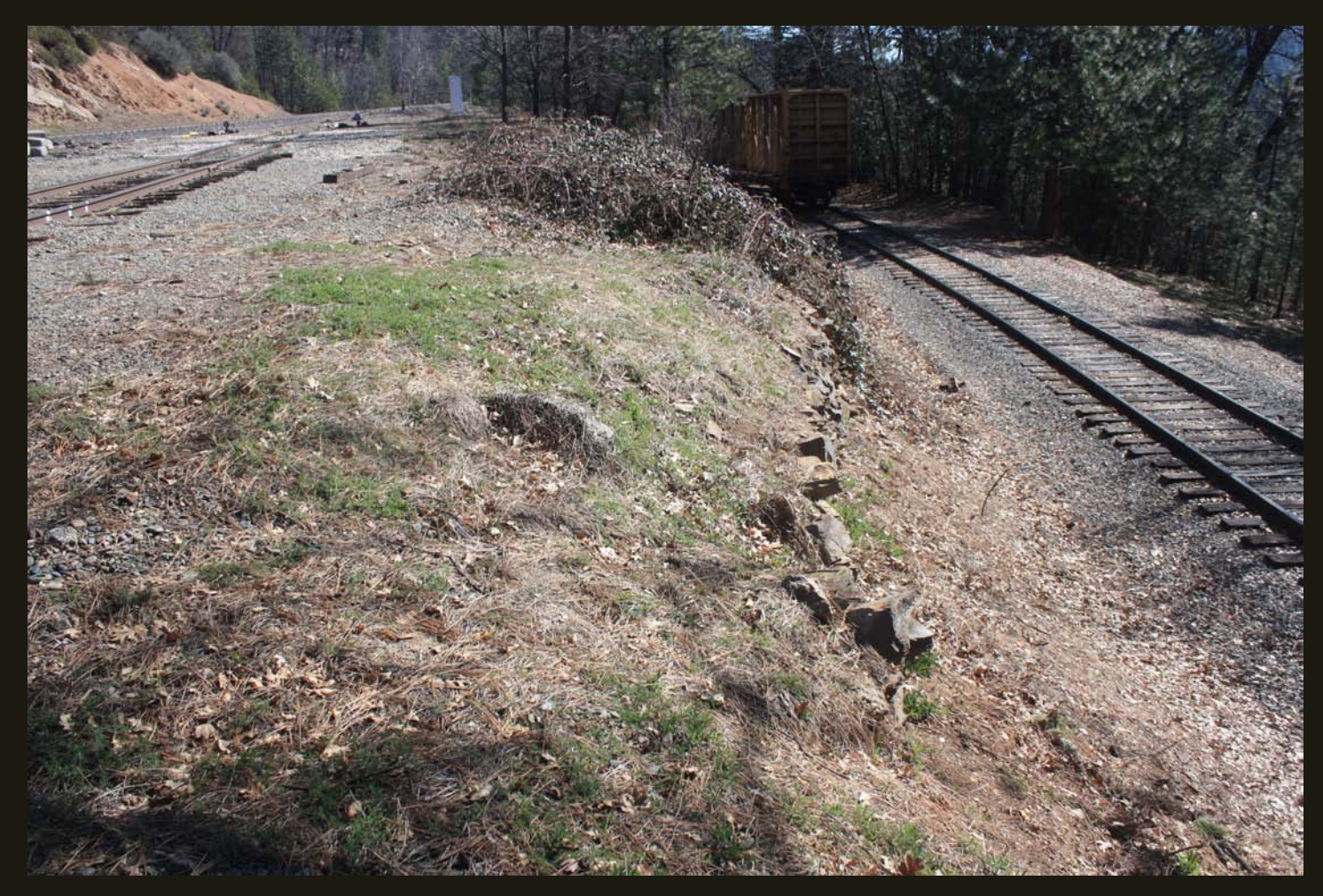
The Quincy & Eastern Railway was incorporated in July 1909 and reorganized three months later as the Quincy Western Railway, which in June 1910 opened a 3.27-mile branch (too short to show separately on the map) from the then-new Western Pacific line to the lumber town of Quincy. The QW reorganized as the Quincy Railroad in 1917. Passenger service ended in the 1950's, but the Quincy Railroad remains an active lumber railroad.

The track in the upper left is the WP (now Union Pacific) mainline and the lower track on the right is the Quincy Railroad, with a consist of empty lumber cars heading back down the hill to Quincy from Quincy Junction.