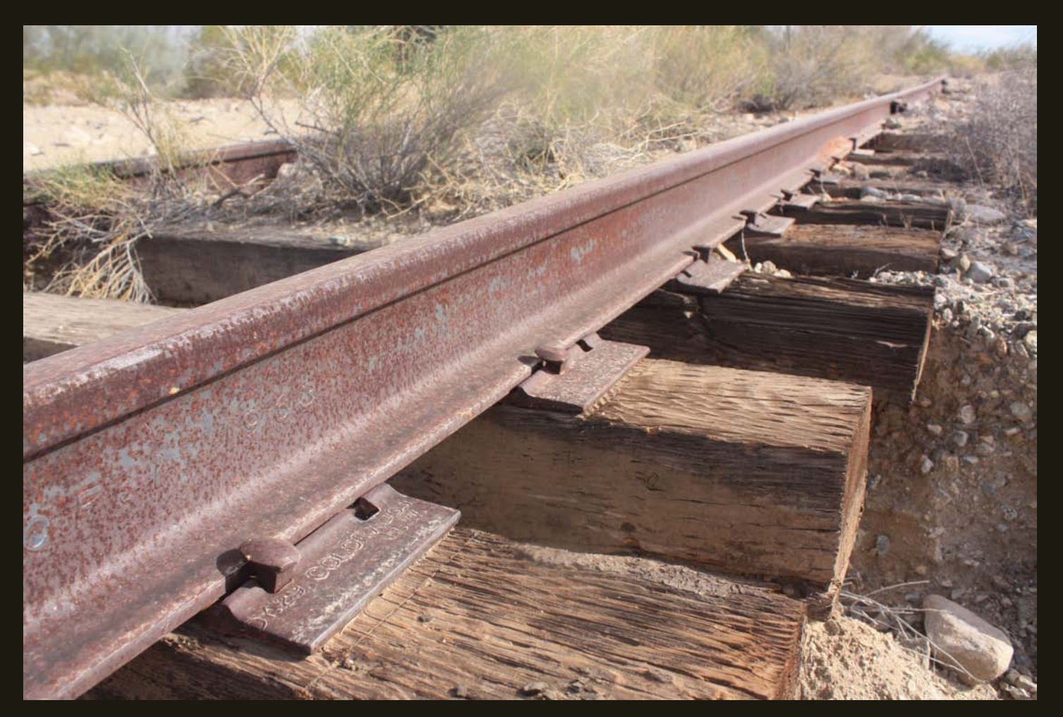
Parts of the EM are washed out near Summit.