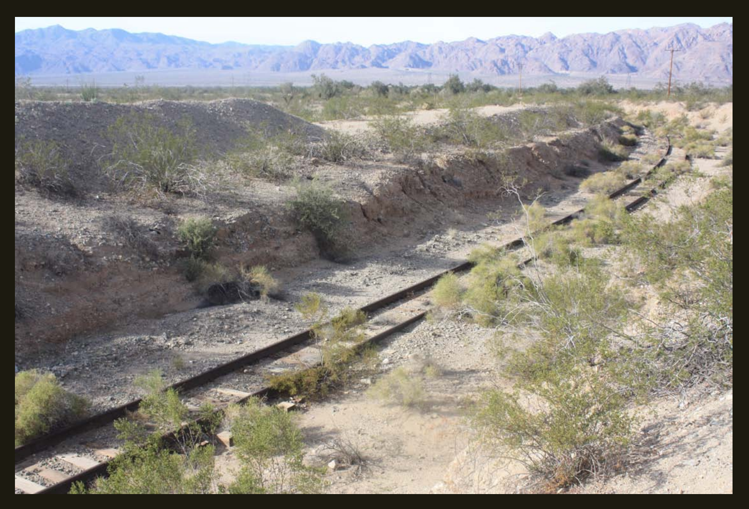
The Eagle Mountain Railroad was constructed in 1947–1948 by the Kaiser Steel Corporation to haul iron ore 51 miles from Kaiser's Eagle Mountain Mine to an interchange with the Southern Pacific mainline at "Ferrum" (Latin for "iron"). The EM features grades as steep as 2.15 percent on its climb out of the Salton Trough. The railroad was last used in 1986 and remains dormant.

This northward view near the high point on line, appropriately called Summit, features a long cut grade to lower the high point and thus the grade. The Eagle Mountains and Joshua Tree National Park are in the distance.